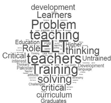
Several coding references to extent of coding references against the thematic nodes are presented in figure 2 compared with the query of hierarchy nodes. The areas of challenges in developing critical thinking during ELT, and comparison of public and private institutions in terms of critical thinking development were the bigger areas in comparison to other codes.

The researcher kept all the interviews transcript in textual form. The researcher employed the NVivo 12 Pro version to organize, analyze, and visualize systematically the insights of interviews through software. Initially, to highlight the most frequently used words, the researcher used the word cloud. This word cloud was tagged with codes and reference codes. It is demonstrated the bases of various themes.