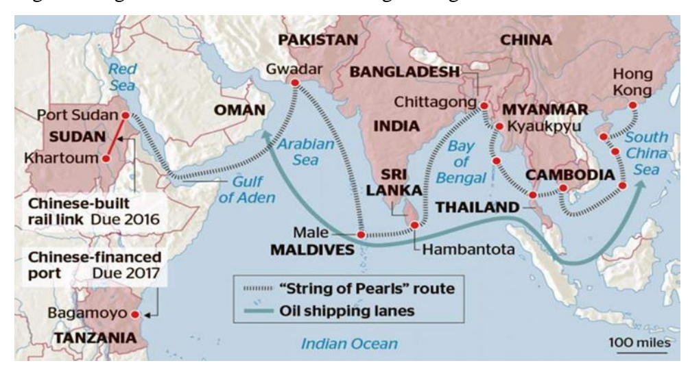
Fig 4: String of Pearls Route