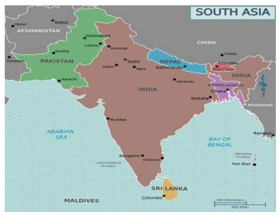
Geopolitical Importance of South Asia